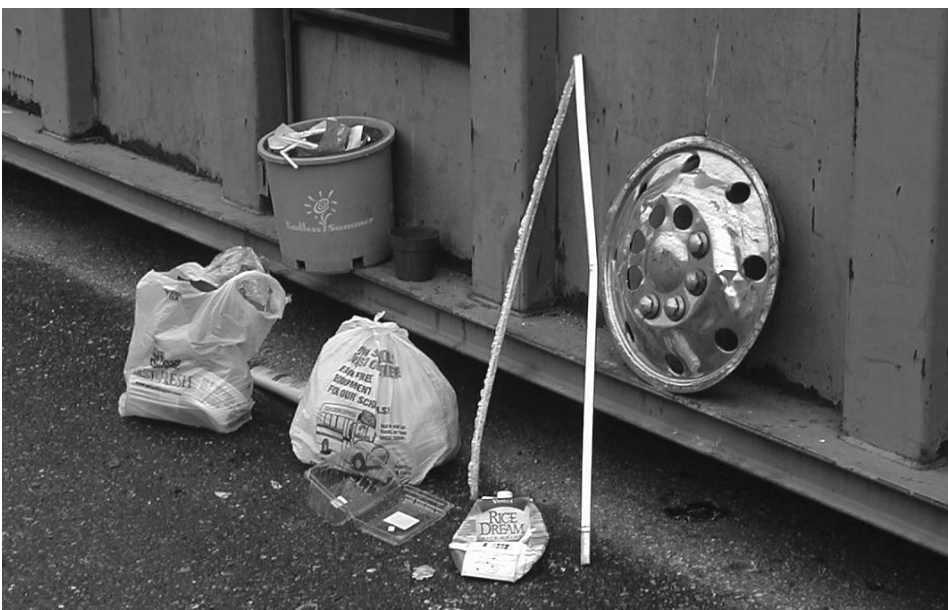
Trash outside the dumpsters at the Guilford Country Store.